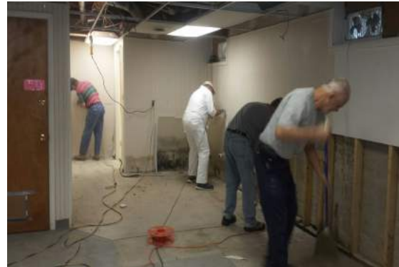
Contaminated drywall was gutted out to 42 inches above floor level.