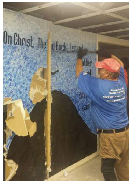
Non-load-bearing partitions were demolished and removed.