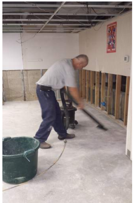
After cellar toilet fixture removal, an unanticipated sewer line back-flow issue was resolved by the engineering committee with a high-technology cutoff valve and a floor-mopping with bleach.

Contaminated furnace intake ducting was opened and cleaned, all debris and dirt were removed, walls and floor were cleaned and sprayed with bleach solution and allowed to dry. The preparatory work and hands-on participation by members of the Silver Lake congregation allowed us to complete the job of clearance, gutting, and cleanup in just two days.