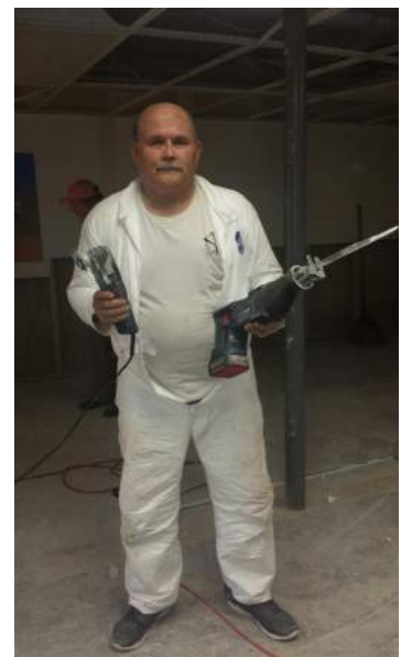
Our team always tries to make a workplace fashion statement.